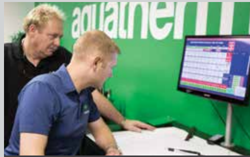
Planning and design