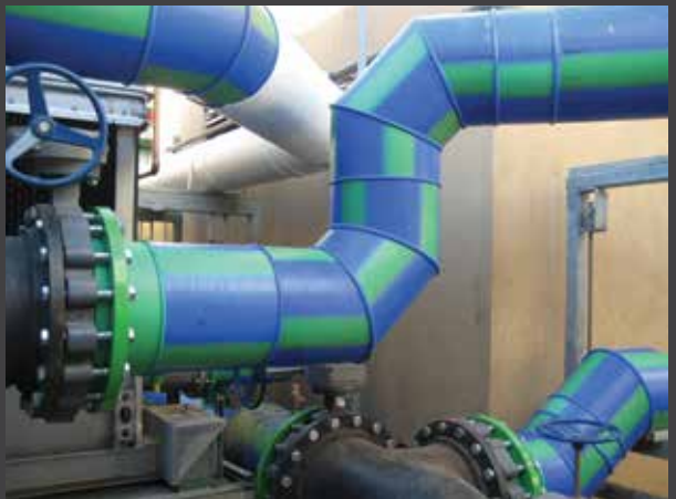
Los Angeles County Metropolitan Transportation Authority, Los Angeles, CA. 28-story chiller pipe retrofit.