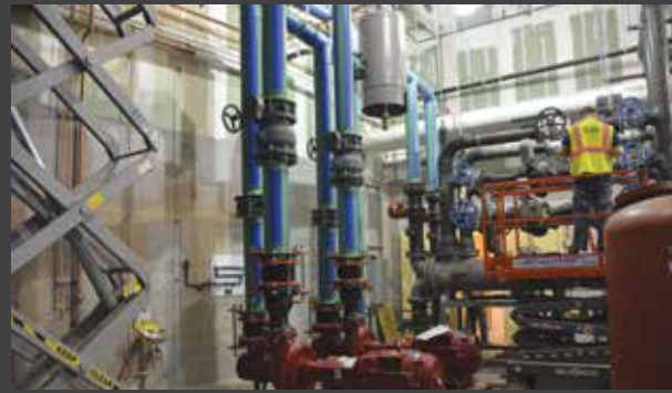
TCF Bank Stadium, Minneapolis, MN. Radiant field heating.