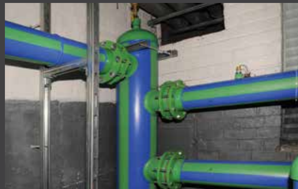
Crescent Apartments, East Rockaway, NJ. Hydraulic separator, boiler retrofit.