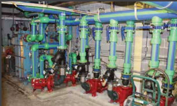
Corpus Christi Athletic Club, Corpus Christi, TX. Condenser water line retrofit.