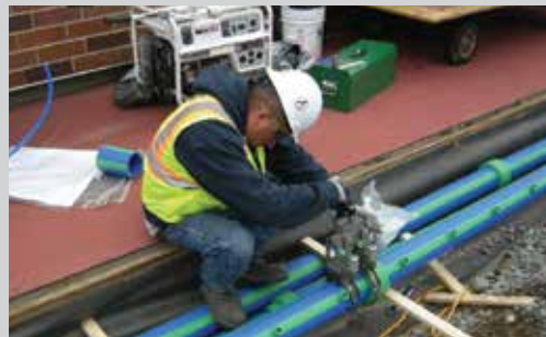
Contractor installs at jobsite