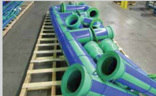
Loading and shipping