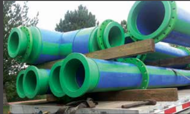
Essentia Health-Fargo, Fargo, ND. Chilled water/cooling tower project, 24-in. and down fabrication.