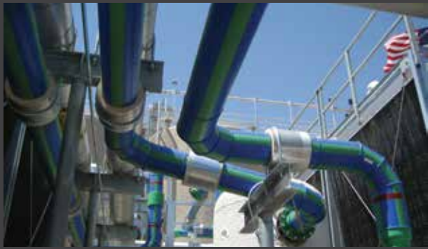
Bogle Vineyards, Clarksburg, CA. Chiller lines serving fermentation vats.