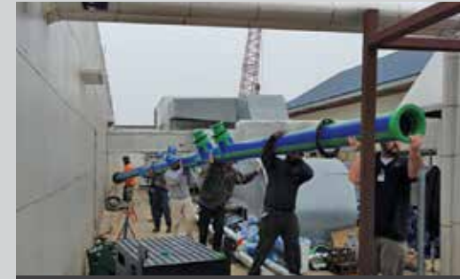
The weight advantage is significant